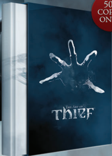
Special Slipcase Limited Edition Including exclusive posters