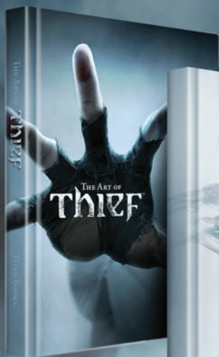
Standard Hardback Edition

A breathtaking gallery of Thief concept art and in-depth creator commentary