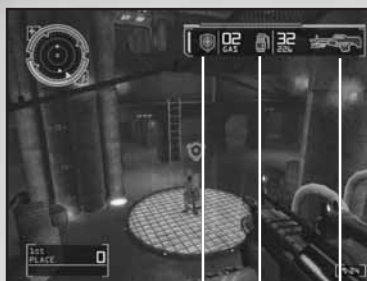
Primary Weapons Secondary Weapons Bio-augmentations

The inventory has three categories: Primary Weapons , Secondary Weapons and Bio-augmentations . All inventory items must be acquired.